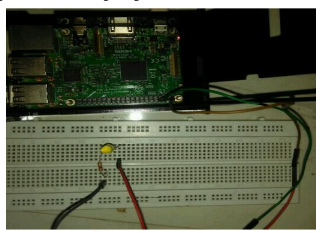
Fig 3:-Hardware design

You can program the pin to interact with different things in the world. Input comes from any sensor or computer and from any device. The output can do anything; it can turn on LED or other hardware equipment by sending a signal to another device. If raspberry pi is on a network, you can control device that are attached to it from anywhere. It is very powerful and exiting thing to control the devices over the network.