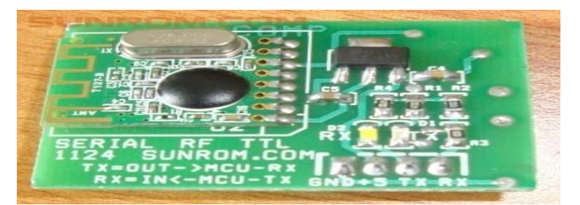
Figure 4:RF LINK