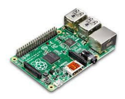
Fig 1: Raspberry Pi Board

also plays high-definition videos. We want to see it being used by kids all over the world to learn how computers work, how to manipulate the electronic world around them and, how to program. The original Raspberry Pi is based on the Broadcom BCM2835 system on a chip (SoC), which includes, Video Core IV GPU, RAM of 512 MB. The system has Secure Digital (SD) socket for boot media and persistent storage. A SoC consists of the hardware, described above, and the software controlling the microcontroller, microprocessor or DSP cores, peripherals and interfaces. The design flow for Soc aims to develop this hardware and software in parallel